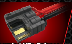
Integrated LiPo Balance Charging Wires