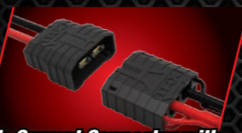
High-Current Connector with Gold-Plated Copper Terminals

Use with Traxxas iD Chargers for the easiest and safest charging solution Traxxas® iD™ chargers auto-detect iD equipped Traxxas batteries and automatically optimize charge settings for worry-free charging*