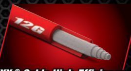
MAXX® Cable High-Efficiency 12-Gauge Silicone Jacketed Wire