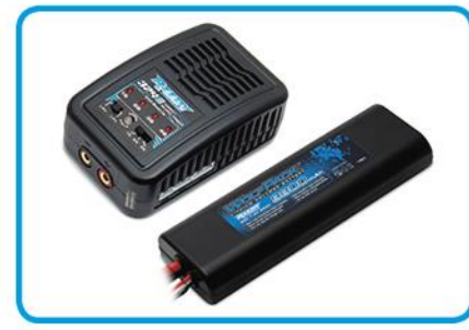
#70019C Combo includes a Reedy Compact Balance Charger and Reedy 7.4V LiPo Battery with T-plug