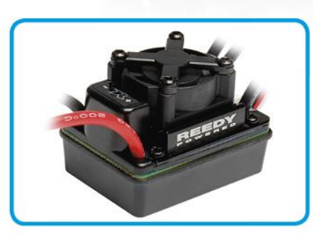
Water-resistant Reedy brushless electronic speed controller with High Current T-Plug