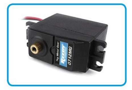
Metal-gear, digital, high-torque Reedy servo