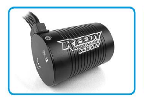
Reedy 3300kV brushless motor