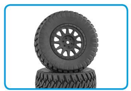
High-traction racing compound tires mounted on hex drive wheels