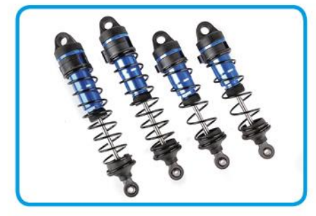
Fluid-filled, blue anodized aluminum V2 12mm shock bodies, front and rear