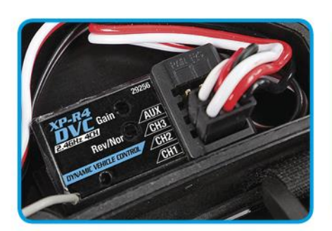
New DVC (Dynamic Vehicle Control) receiver featuring built-in adjustable gyro