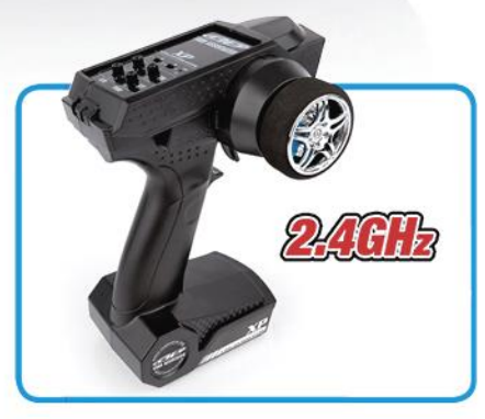
XP 2.4GHz radio system