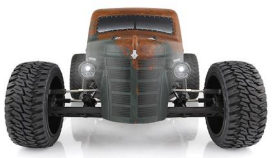
Factory-finished body with integrated LED lights, 2 front, 2 rear