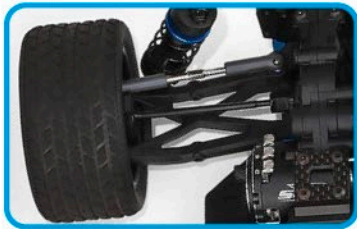
Rear CVA drive shafts for more reliability