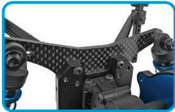
Updated mid-motor rear carbon fiber shock tower for oval