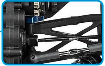
Updated rear toe block for dirt oval racing