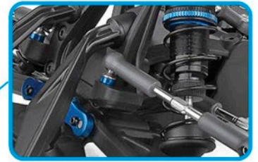
Vertical ball ends for roll center adjustments, front and rear