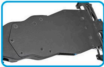
New mid-motor low center of gravity G10 fiberglass chassis