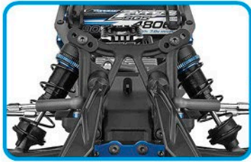
Adjustable suspension geometry