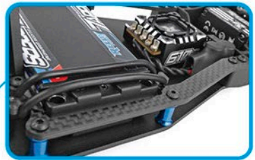
New carbon fiber chassis side braces