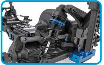
Aluminum 12mm coil-over shock absorbers

Due to ongoing R&D, photos may not match final kit. Vehicle shown on these pages equipped with items NOT included in kit: Reedy motor, battery, ESC, servo, receiver, wheels, tires, and pinion gear. Assembly and painting required.