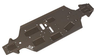
#81589 RC8B4 FT Chassis, RWB