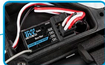
DVC (Dynamic Vehicle Control) receiver featuring built-in adjustable gyro