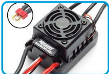
Water-resistant, Reedy brushless electronic speed controller with High Current T-Plug