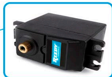
Metal-gear, digital, high-torque Reedy servo