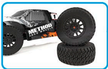
High-traction, racing-compound tires mounted on hex drive wheels