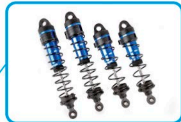
Fluid-filled, blue-anodized aluminum V2 shock bodies, front and rear