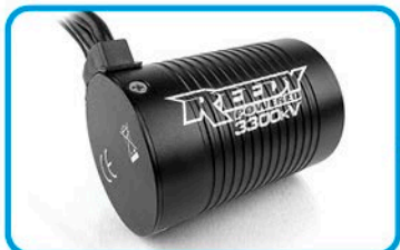
Powerful Reedy 3300kV brushless motor