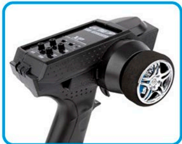
2-channel 2.4GHz radio