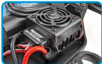
Water-resistant high-power Reedy brushless speed control with T-plug connector and LiPo low-voltage cutoff