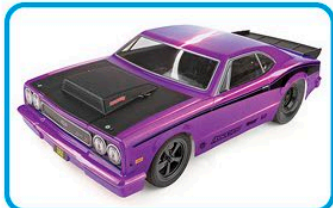
Factory-finished two-piece Reakt drag race body with rear spoiler