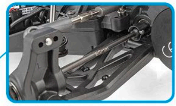
Rear CVA driveshafts for more reliability