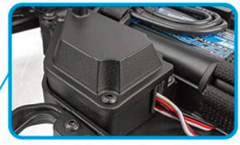
Water-resistant enclosed receiver box