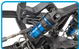
Aluminum 12mm big bore coil-over shock absorbers