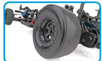
Lightweight drag race-inspired wheels wrapped with high-grip rear drag slick tires, 12mm hex

Due to ongoing R&D, photos may not match final kit. #70028 vehicle shown on these pages equipped with item NOT included in kit: Reedy battery. Battery is included in the #70028C combo.