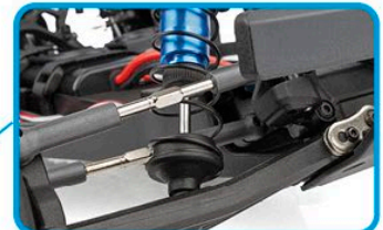
Rugged steel turnbuckles for adjustable camber and front toe-in