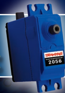
High-Torque Waterproof Servo