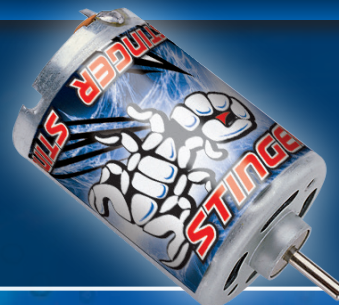
Water Cooled Stinger 20-Turn Electric Motor