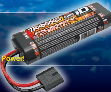
7.2 Volts of Power!