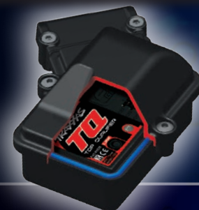
Waterproof Receiver Box