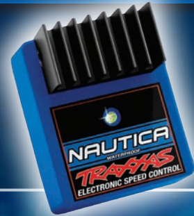
Nautica Electronic Speed Control