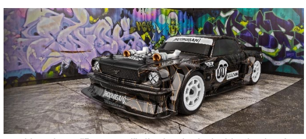
Hoonigan "Burnyard" display included in the box!