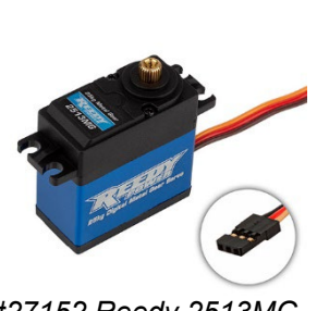
#27152 Reedy 2513MG Digital Metal Gear Servo