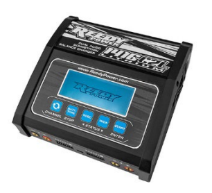
#27203 Reedy 1416-C2L Competition AC/DC Dual Battery LiPo Charger