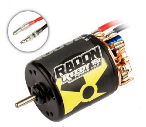
#27425 Reedy Radon 2 15T 3-Slot 4100Kv Brushed 540 Motor