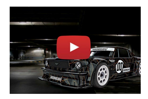
WATCH THE VIDEO! https://youtu.be/pveT1JIaYts

The engineers at Team Associated spent countless hours capturing many of the details synonymous with the 1965 Ford Mustang Hoonigan Hoonicorn. Features including officially licensed American Racing VF503 Wheels, rear diffuser, molded intake and turbos, scale brake rotors, and more!