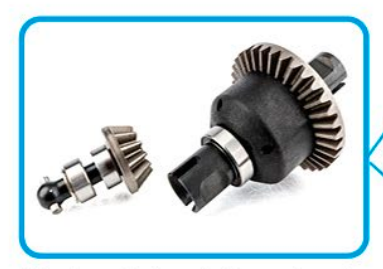
The Apex2 chassis is equipped with metal ring and pinion gears for long-lasting durability that can handle tire-slaying burn-outs